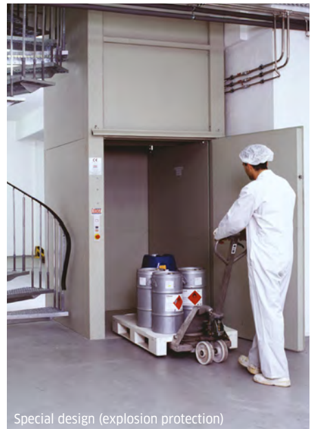
Special design (explosion protection)